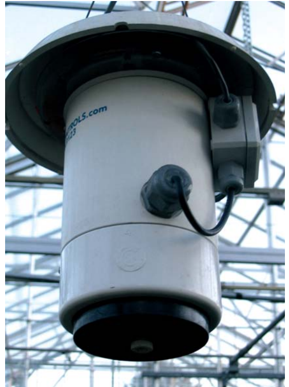
Temperature and humidity sensors should be in an enclosure to keep them in the shade. This container has a fan and filter, both of which should be checked regularly, to provide adequate air flow past the sensors.

H ow do you decide when to water and how much water do you need to apply? There really is no good quantitative information on how much water plants need. One reason for this is that water has long been a relatively cheap and plentiful resource. However, that is rapidly changing. Population growth and increased urbanisation has increased the demand for limited water supplies. Environmental regulations are becoming stricter thus, the pressure on greenhouse growers to use water more efficiently will increase, for both economical and environmental reasons. Based on research we have done in the last year, plants need less water than you would expect. However, plant water needs are not constant and as you may expect, increase as the plant grows. That raises the question of how automated irrigation systems can adjust the irrigation amounts based on actual plant water needs.