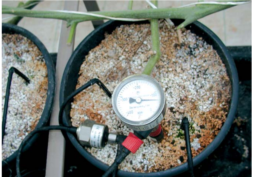
A tensiometer can measure the water tension in the substrate. If this drops below a certain point the watering system can be turned on automatically.

Leaf temperature can be measured in different ways using leaf temperature sensors or with infra-red thermometers. Because infra-red sensors are not attached to the plants, measurements are made via 'remote sensing'. Infra-red sensors are readily available and can easily be connected to many greenhouse control systems.