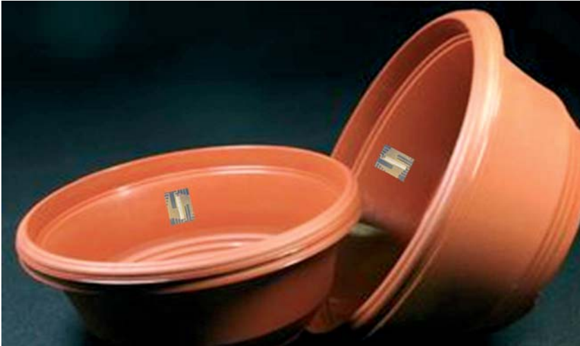
In future it may be possible to have chips embedded in a container to measure water content, EC and pH. The chips could alert a computer when action is required.

sion can be measured with tensiometers, which have been around for a long time. However, tensiometers have been difficult to use in soilless substrates, because of the required maintenance and the need for very close contact of the sensor with the substrate. With traditional tensiometers, any disturbance could break the contact between the sensor and the substrate, resulting in bad readings. Recent improvements in tensiometers have made them easier to use and their use in irrigation control is likely to increase.